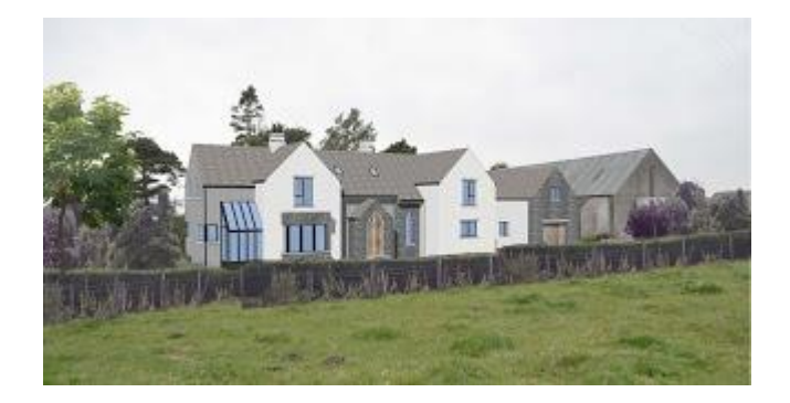
Photomontage of House on the Site

So, after I had finally managed to get to this stage it was down to the making the planning application for reserved matters - which is based on the rules previously set out by the Outline Planning Permission!