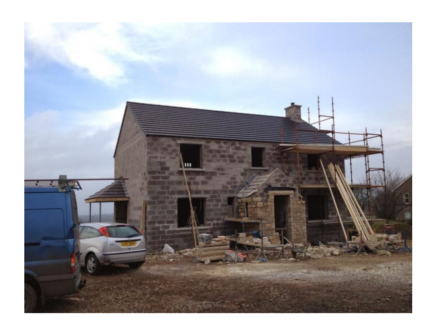
FmK ECOHome No.02 - under construction

Our first home was over double what the current building regulations were at the time of build. These regulations increased in Nov 2012 and as a result we decided to further increase our own methods to stay well ahead again. We decided to bring in a specialist air-tightness company, to advise and train all our FmK team and all our FmK Approved Contractors, so we could move forward with buildings which are more air tight.